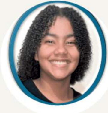
She will attend Bishop Moore Catholic High School.

The Mission Office invites families to open their hearts and homes by becoming Host Parents for a young student from the mountains of our sister Diocese of San Juan de la Maguana .